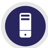
Secure Software and Data Centre