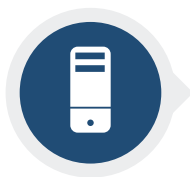
Secure Software and Data Centre