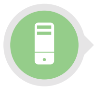
Secure Software and Data Centre